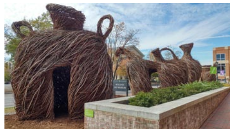
Works by Patrick Dougherty