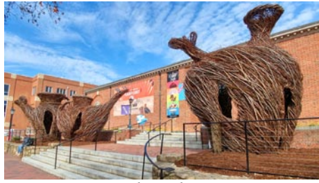
Works by Patrick Dougherty

Owing to the organic material used and the outdoor setting, Step Right Up is a temporary installation, expected to be on