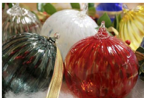
Works from STARworks Glass