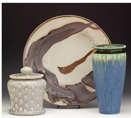
Works from Bulldog Pottery

most recent happenings in their studio at "Around and About with Bulldog Pottery" at ( www.bulldogpottery.blogspot.com ).