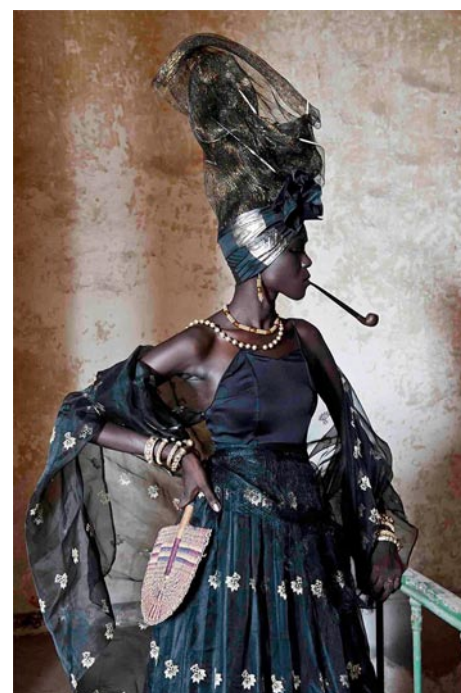
Fabrice Monteiro, "Signare #1", 2011, inkjet print on baryte paper, 47 ¼ x 31 ½ inches, Courtesy Magnin-A © 2011 Fabrice Monteiro.

North Carolina Museum of Art , 2110 Blue Ridge Road, Raleigh. East Building, Level B, Meymandi Exhibition Gallery, Through Jan. 3 - "Good as Gold: Fashioning Senegalese Women," is the first major exhibition of Senegalese gold jewelry to date that focuses on the history of Senegal's gold, from past to present, and the beauty and complexity of the way Senegalese women use ornament and fashion to present themselves. A key theme of the exhibition is the Senegalese concept of sañse (a Wolof word for dressing up or looking and feeling good). Good as Gold explores how a woman in a city like Dakar might use a piece of gold jewelry to build a carefully tailored, elegant fashion ensemble. East Building, Level B, Gallery 3, Through Feb. 7 - "Christopher Holt: Contemporary Frescoes/Faith and Community". "Affirming sacred worth, restoring human dignity, and sabotaging the shame of poverty, the