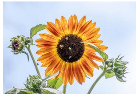
Work by Pete Harding

continued above on next column to the right