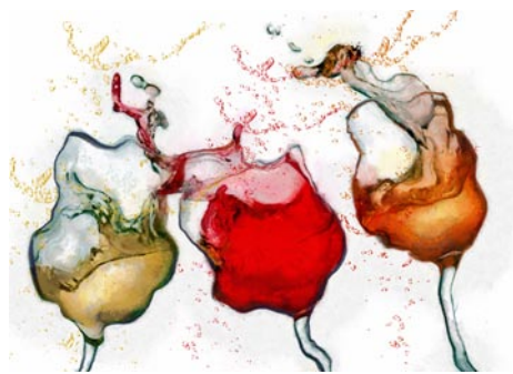
Work by Marilyn Sholin

Her original mixed media incorporate a long process of multiple photo references which she synthesizes into one image and digitally paints. That is printed on high quality canvas and then enhanced with acrylic paints and mediums, dyes, pigments, and a variety of other materials. This method creates many layers of textures to each painting. The fine art paintings are then