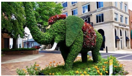
One of the "Signature" Topiaries

Also on view at the Arts Center of Green-