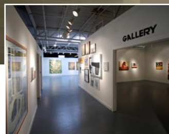
Exhibit in the Heart of the Columbia Vista

Situated in the heart of the Vista, Gallery 80808 is a vital part of the contemporary art scene in the Columbia metropolitan area.