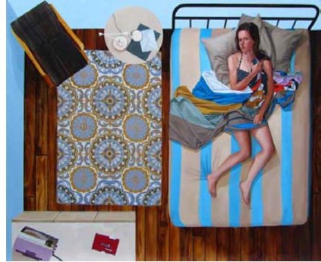
Netflix , by Karen Ann Myers, oil on canvas.

In her paintings, Myers portrays women she knows personally, juxtaposing them against geometrically patterned textiles in her sparingly furnished but optically energized bedroom. Often, the women are posed to mimic the intricate designs of the linens, wallpaper, or rugs found in the scene.