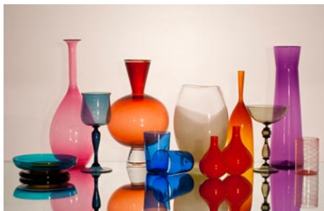
STARwork's NC Glassfest

STARworks, located eight miles south of Seagrove in Star, NC, will hold the NC Glassfest on Mar. 15, from 10am to