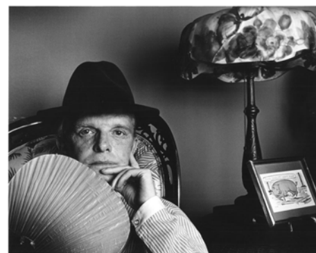
Truman Capote, 1980