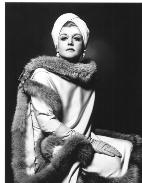
Angela Lansbury, 1966