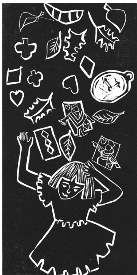
Work by Mary Walker

Children often have magical moments of discovery and wonder which usually fade with time and distraction, but a few may linger to become an inspiration later in life. When I was five, we were living on Long Island renting from wealthy friends. Our section of the house was the old servants quarters connected to the main house through a door at the bottom of the stairs. One day my mother led me through that door. On the other side was a beautiful dining room with a gleaming mahogany table and standing next to the table was Alice in Wonderland ... actually a neighbor girl dressed up for Halloween. But to a five year old, she was a vision that stepped right out of my story book. That was a moment I have never forgotten. It has tumbled around in my mind for years looking for a creative outlet through my work as an artist. However, I was always stalled by my preconceived notion of what she looked like, what the rabbit looked like, what colors were involved. When I finally decided to push past the boundaries of my own preconceived notions (and use only black and white), I was able to begin. These prints are the result."