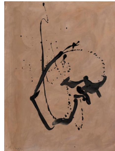
Work by Robert Motherwell (1915-1991)

Hughes Gallery , 2015 Ayrslay Town Blvd. @ N Kings Parade, Ste. 107-c, Charlotte. Ongoing - The gallery is a modern art gallery with a focus on sculpture, installation, works on paper, photography and painting. Hours: Mon.-Sat., 10am-6pm. Contact: 704/492-9934 or at ( www.hughesgallery.artlogsites.com ).