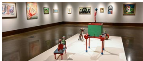
View of Insider Art exhibit at Wofford College