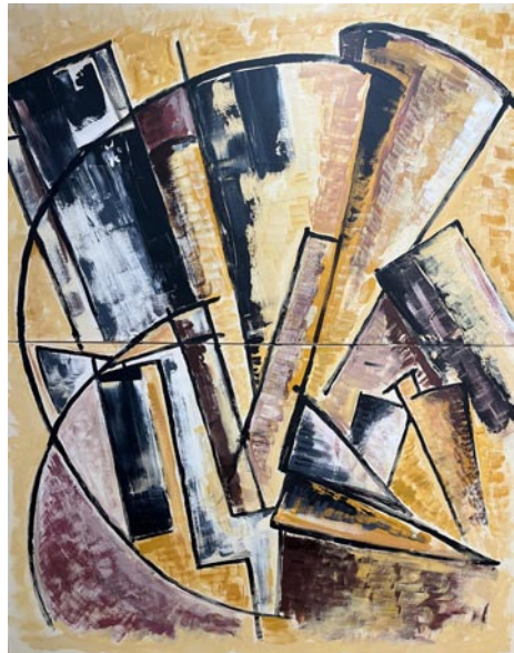
Work by Perviz Heyat

For further information check our NC Institutional Gallery listings, call the gallery at 336-723-5890 or visit ( www.Artworks-Gallery.org ).