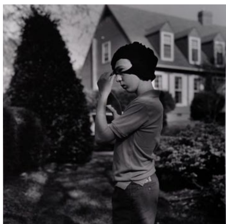
Work by Susan Harbage Page

Cameron Art Museum presents the only sculpture park in the country created to honor the United States Colored Troops and their fight for freedom. The opening of PNC USCT Park marks the one-year anniversary of the unveiling of Boundless, the public sculpture by artist Stephen Hayes that commemorates the United States Colored Troops and the Battle of Forks Road. This park creates a gathering