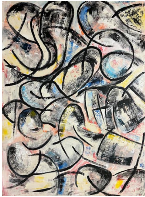
Work by Perviz Heyat

Heyat approaches his art with belief in complete freedom of expression. He believes that every person has art within them and that we all use art every day. The choices we make in our lives reflect the artistic direction of our existence, with a delicate balance of the opposing forces of rules and freedom. This balance of opposing forces is a necessary part of being human.