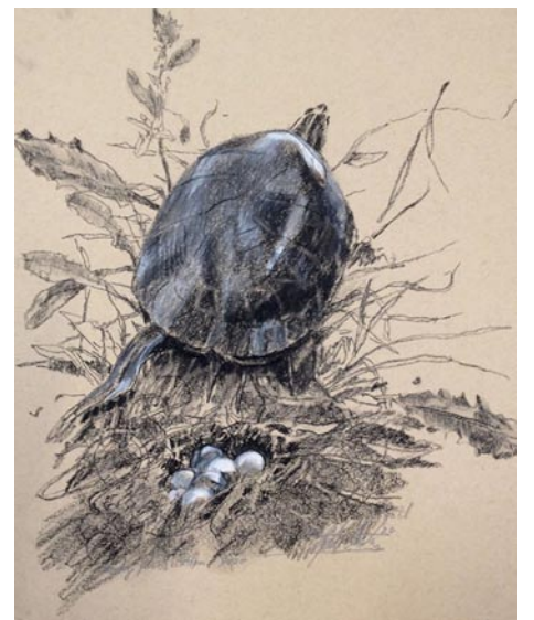
Work by Stephen Chesley

Native American tribes hold the turtle as a sacred creature, representing Unci Maka, or Grandmother Earth. The patterns on its shell reflect an annual calendar's divisions into months (the number of full moons in a year). In both Asia and Native America the turtle also symbolizes steadfastness and perseverance.