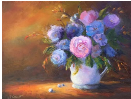
Work by Brenda Orcutt artist.

Orcutt captures the essence and vibrancy of flowers using the palette knife as her preferred method to apply and move oil on the canvas. With bold strokes and intricate details, the paintings breathe life into each blossom, with an explosion of color and texture. Each painting serves as a gentle reminder to cherish and appreciate the peaceful and fleeting moments of nature's