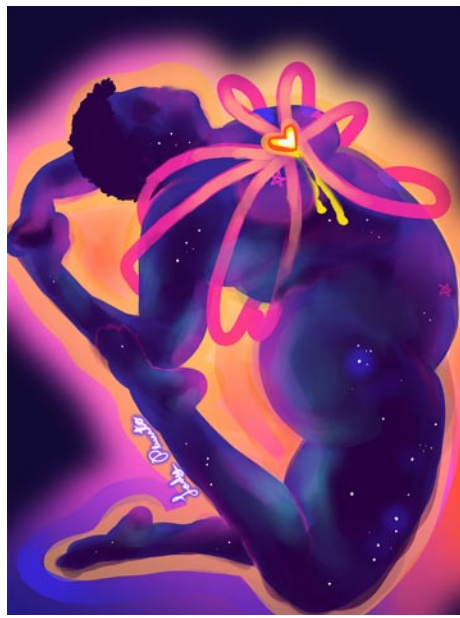
Work by Lady Pluuto

An artist and muralist based in Spartanburg, she says her choice of medium is acrylic paint. “I also use Procreate for my digital paintings such as the ones in this latest exhibition.” The 20 pieces in the show will be available for purchase with prices ranging from $70 to $464.