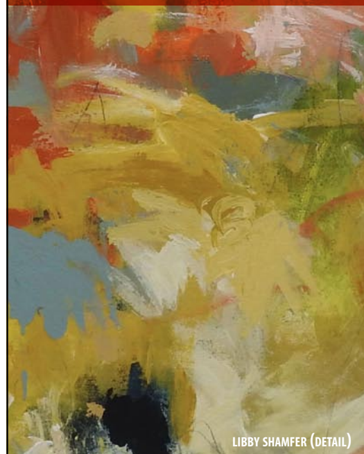
LIBBY SHAMFER (DETAIL)