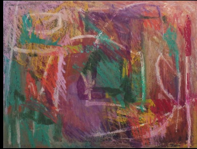
Growing by William Halsey, 1992 oil pastel and paint stick on paper, 18 x 24 inches

Paintings Graphics & Sculpture for the discerning collector