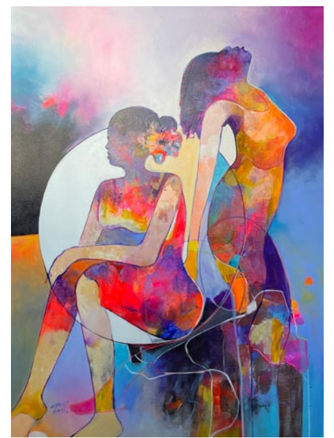
Work by Charles Nkomo

The Movement of the Moon will feature the paintings of Charles Nkomo, who was born and raised in southwest Zimbabwe. The wild animals of Africa make frequent appearances on his canvases. Distinct brush strokes accompanied by bold colors and energetic patterns all unify to create engaging