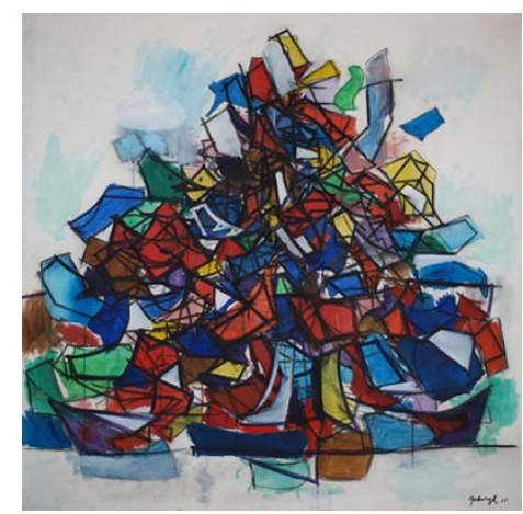
Work by Robert Goodnough

Appalachian Cultural Museum, University Hall Drive, off Hwy. 321 (Blowing Rock Road), Boone. Ongoing - The permanent exhibit area includes, TIME AND CHANGE, featuring thousands of objects ranging from fossils to Winston Cup race cars to the Yellow Brick Road, a section of the now closed theme park, "The Land of Oz". Admission: Yes. Hours: Tue.-Sat., 10am-5pm & Sun., 1-5pm. Contact: 828/262-3117.