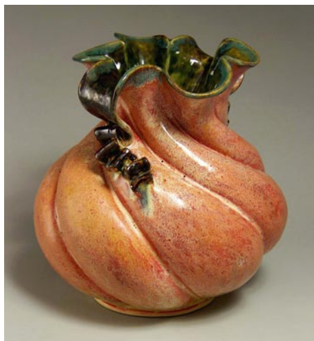
Work by Turtle Island Pottery

Inner Peace Center for the Arts , 700 N. Roberts Avenue, Lumberton. Ongoing - We are an art gallery designed to educate, enlighten, enrich and entertain patrons of all ages while providing leadership and support to advance the visual and performing arts in our community. Hours: Wed.-Fri., 11am-5pm. Contact: 910/733-1046 or at ( www.ipcars.com ).