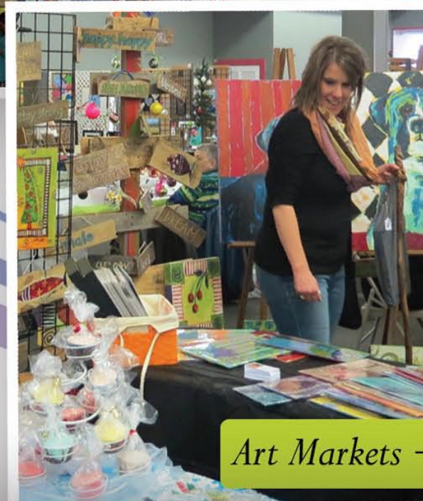
Art Markets + Fairs

The arts are alive and well in the Cultural Arts District!