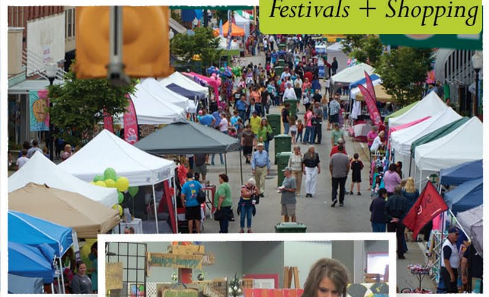
Festivals + Shopping