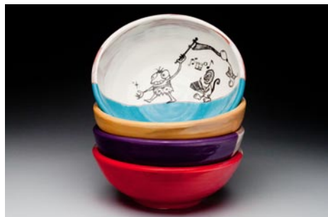
Works by Erik Haagenen

Ackland Art Museum , UNC - Chapel Hill, Columbia & Franklin Streets, Chapel Hill. Through Dec. 31 - "Highlights from the Permanent Collection." The Ackland Art Museum presents a major reinstallation of highlights from its diverse permanent collection of over 17,000 works of art. The first presentations include The Western Tradition, from Ancient art to twentieth-century art; Art from West Africa; Art from China and Japan; and Art from Southern and Western Asia. Museum Store Gallery (Franklin and Columbia Street), Store hours: Mon.-Sat., 10am-5:30pm & Sun., noon-5pm. Museum Hours: Wed.-Sat., 10am-5pm and Sun., 1-5pm. Contact: 919/966-5736 or at ( www.ackland.org ).