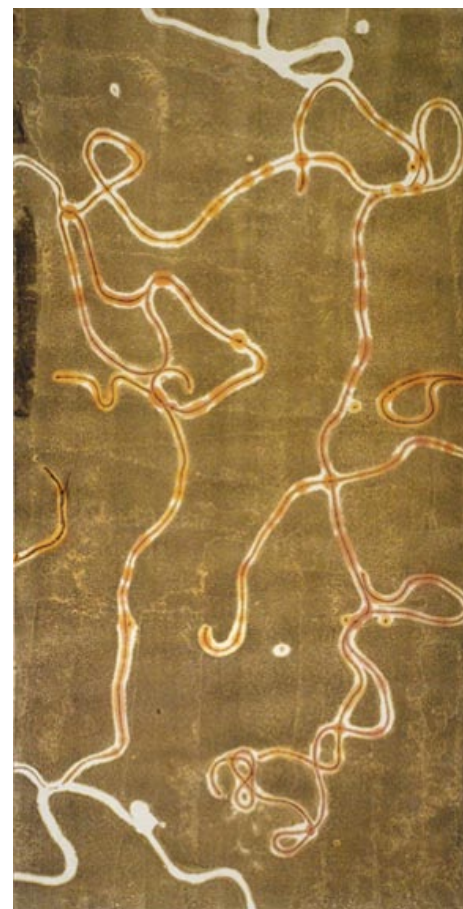
Work by Jane Allen Nodine

The Contemporary Print Collective 2015 Print Exposition will show at the UPSTATE Gallery on Main located on E. Main Street in Spartanburg, from Nov. 12 through Dec. 31, 2015. The gallery offers a broad range of cultural, conceptual and technical exhibitions in the visual arts