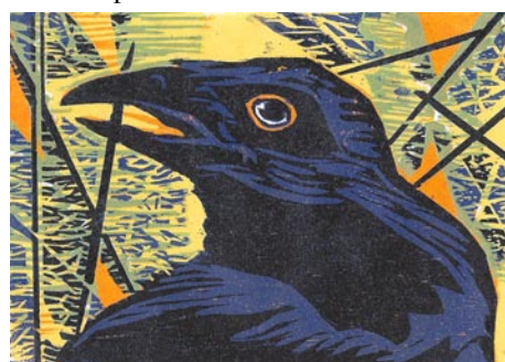
Work by Steven Chapp

Contemporary Print Collective will show in November as the guest exhibition at The Art Cellar located on South Main Street in Greenville, from Nov. 6 - 30, 2015. The salon style gallery showcases over 40 local artists with a wide range of mediums, styles, and prices. The artists from the CPC group will be at the gallery's First Friday art reception on Nov. 6, from 6-9pm.