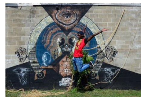
Work by Ron Anton Rocz

This eclectic exhibition of color photography focuses on scenes of unique elements of Charleston culture, atypical from what is commonly seen on the standard bus tours or in the photography books and commercial representations of Charleston. Beyond the edifices of antebellum homes, churches, and governmental structures, off the beaten path, are expressions of the other elements of Charleston culture - the working class, the African American, the youth culture, the juke joint life, the "other" Charleston. Some of the scenes are now bygone; some are deteriorating, some are emerging, all are relatively hidden but nonetheless significant and telling of the story of Charleston's people. These photographic images are drawn from Rocz's accumulated "historical" files