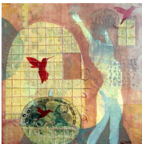
Work by Toni Carlton

For 21 years Carlton Gallery was located in the Creekside Building, which in the 70's was formally known as the Kiln Room located 10 miles south of Boone, NC. In 2008, Carlton Gallery moved across Hwy. 105 into the former Antonac-