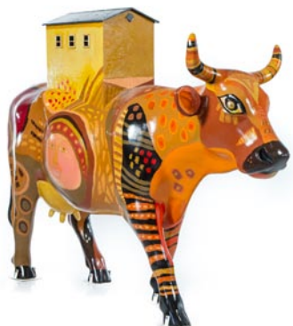
Cow design by Jane Filer

UNC Asheville's Center for Craft, Creativity & Design in Hendersonville, NC, has extended, Bridge 11: Lia Cook , featuring a solo exhibition by this internationally recognized fiber artist, on view through Nov. 9, 2012. Cook is a pioneer of the modern fiber-art movement and was one of the first to utilize a digital Jacquard loom as an art tool. The exhibition includes large-scale weavings created on Jacquard looms from photographic images that have been digitized into a computerized code for the loom to read. For further information call the Center at 828/890-2050 or visit ( www.craftcreativitydesign.org ).