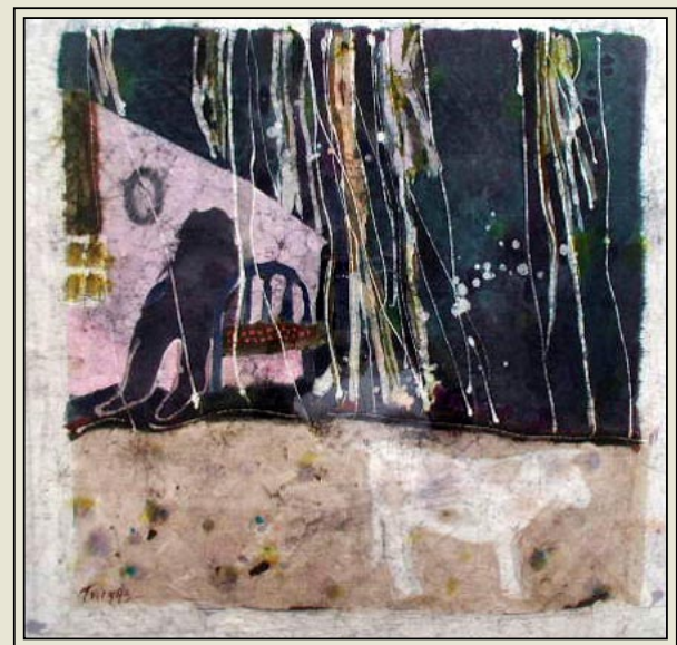
Sanctuary with Cow, 2005 Batik 24 x 24 inches