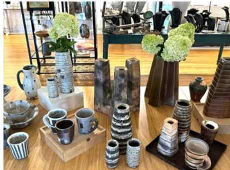
Works at The Gallery at Flat Rock

The Art House Gallery and Studio , 5 Highland Park Road, East Flat Rock. Ongoing - Fine art gallery and private party venue featuring works by Susan Johnston-Olivari and other local artists. Hours: by appt. only. Contact: 828/808-3594 or at (www.arthousegalleryandstudio.com).