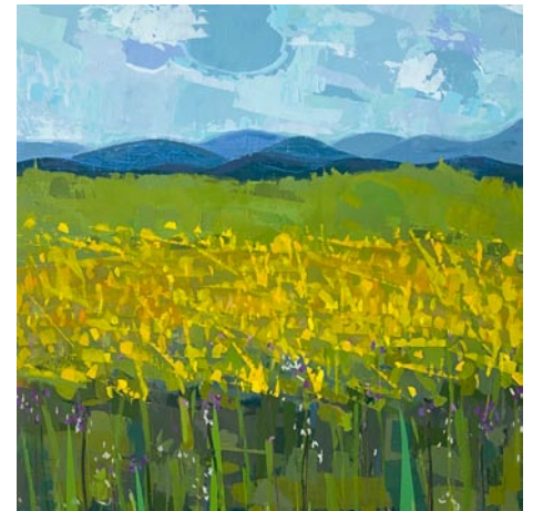
Work by Moni Hill

Southeast Center for Photography , 116 E. Broad Street, Greenville. Ongoing - An exhibition and education venue promoting the art and enjoyment of fine photography. Through monthly juried exhibitions, local, national and international photographers of all skill levels have the opportunity to have their work presented and enjoyed by collectors, curators, enthusiasts, interior designers, and colleagues. In addition, exceptional photographers will be invited to participate in solo or group shows. Our workshop and class schedule cover all aspects of photography and challenges, encourages and inspires the photographer in all of us. Hours: Wed.-Sat., 10am-5pm and First Fridays until 9pm. Contact: 864/605-7400 or at ( www.sec4p.com ).