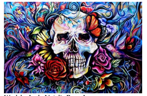
Work by Lady Natalia Perez Lozano

“Looking for a creative outlet, I rekindled the joy of painting again. What started as a personal escape to rediscover myself soon became a means to spread joy to many people around the world with the help of