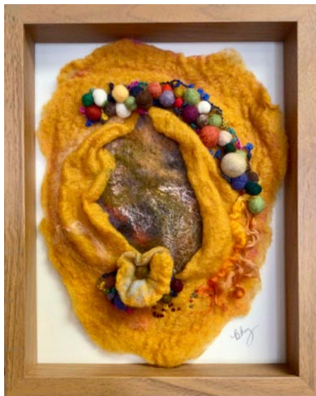
Work by Bonnie Younginer

For further information check our SC Commercial Gallery listing, call the gallery at 843/501-7522 or visit ( https://charleston-craftsgallery.com/ ).