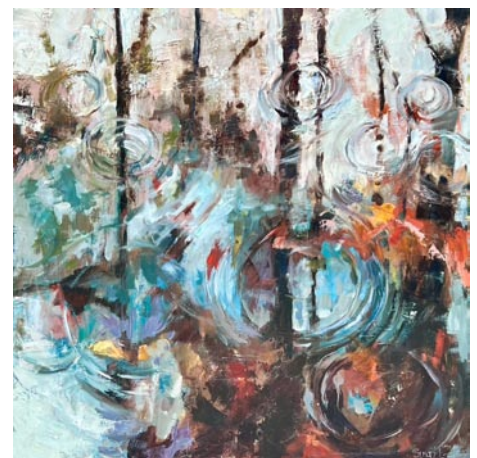
Work by Susan Hecht

This show also includes several large-scale paintings portraying the vastness and power of oceans, the ebb and flow of the tides, and whispering sea oats. The light and shadows in Hecht's paintings of dunes highlight the beauty of something as ordinary as sand, with footprints giving a subtle nod to the human connection. These works serve as