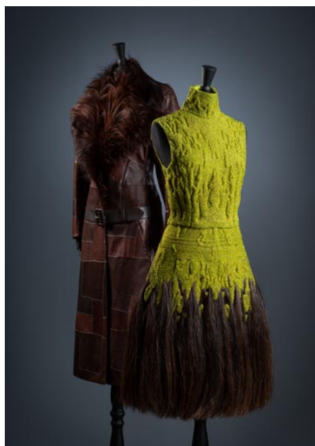
Alexander McQueen, Leather patchwork coat with fur collar and chartreuse glass bead and horsehair midi dress Eshu, Autumn/Winter 2000

Columbia Museum of Art , Main & Hampton Streets, Columbia. Through Oct. 22 - "Spotlight: Yvonne Wells". Wells creates dynamic story quilts highlighting powerful historic Alabama figures such as Helen Keller. From the collection of the Montgomery Museum of Fine Arts. Through Oct. 22 - "Constantine Manos: A Greek