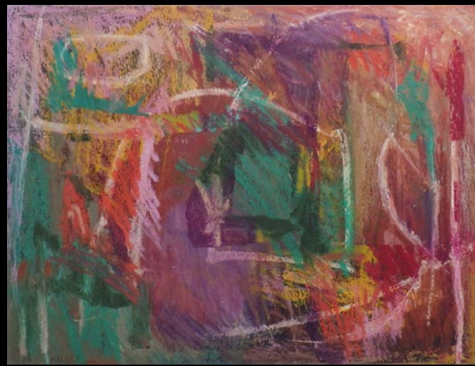
Growing by William Halsey, 1992 oil pastel and paint stick on paper, 18 x 24 inches

Paintings Graphics & Sculpture for the discerning collector