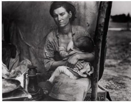
From the Migrant Mother Sequence, Image #3, Nipomo, CA, Migrant Agriculture Worker's Family Seven Hungry Children. Mother Aged Thirty-two. Father is Native Californian. Nipomo, CA, FSA, 1936, by Dorothea Lange (American, 1895 - 1965). Gelatin silver print, 11 x 14 inches.

A bustling seaport in the 1700s, Charleston was a melting pot of cultures, religions, and traditions. Powered by the labor of enslaved peoples in the rice and