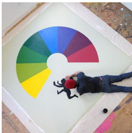
Scott Avett with "Jumping Boy, Color Wheel", 2019, Courtesy of the artist and Crackerfarm; © 2019 Scott Avett; Photograph: Crackerfarm

GMOA's Mission: To inspire, educate, and connect people through the visual arts by way of our collection, exhibitions, and