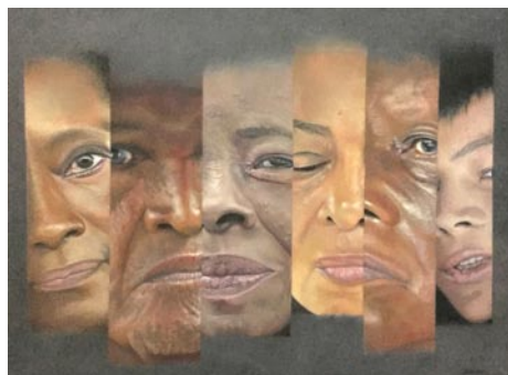
Work by Donna Slade

Indigenous and Afro-Colombians have long inhabited land rich in resources. However, free-market capitalism and trade between Colombia and other countries, including its largest supporter - the United States - has aided and abetted the displacement of many communities in Colombia by allowing multi-national corporations to seize land already occupied for extractive projects (gold, oil, gems) and tourist ventures. Valuing prosperity over people's lives, these businesses, supported by na-