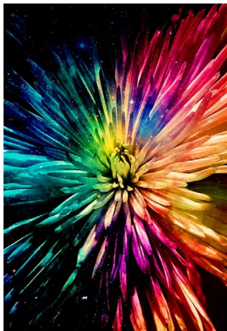
Work by Lynda Wright

Craven Arts Council & Gallery in cooperation with Swiss Bear is proud to present the annual Mum’s the Word exhibition in the Main Gallery at the Bank of the Arts in downtown New Bern. This exhibition highlights local artists and the annual Mumfest - now MumFeast. Celebrating New Bern’s annual Mumfest, Mum’s the Word gives local artists of all mediums, skill levels, and styles a chance to exhibit and sell work in the downtown area. One work will also be selected to be the 2021 MumFeast logo, featured on tee shirts, bags, banners and other promotional materials.