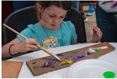
View of a child at a previous Artrageous