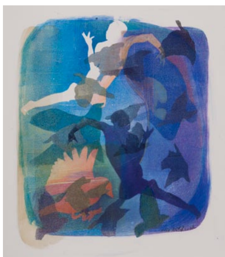
Work by Alix Hitchcock

Last Seen , by artist-photographer Lorraine Turi, is a collection of her photographs taken in the last known locations inhabited by now-extinct species. Leading up to her photo documentation, Lorraine performed exhaustive research, creating lists of extinct beings, even re-tracing the footsteps of explorers who witnessed and documented the decline and destruction of particular species. The images in Last Seen serve as a