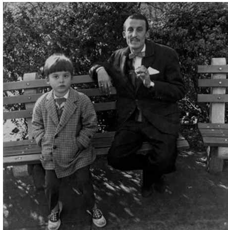
Diane Arbus, "Man and a Boy on a Bench in Central Park, NYC", 1962, gelatin silver print, 20 x 16 in. Weatherspoon Art Museum. Museum purchase by exchange, 2012. © Diane Arbus.

These works drawn from the museum's collection explore familial relationships, be they between mother and child or self-identified families, and less fixed, but equally important ties - to lovers, friends, and even objects. And, because life can be arduous at times, the tension, separateness, and alienation that result from unhealthy ties or from a lack of connection are also considered.