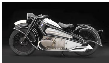
BMW R7 Concept Motorcycle, 1934, BMW Classic Collection

Nature Art Gallery , inside the Museum Store, North Carolina Museum of Natural Sciences, 11 W. Jones Street, downtown Raleigh. Through Oct. 2 - "Up Close and Personal, The Beauty of Tiny Insects," featuring works by Stan Lewis. Oct. 7 - 30 - "Tonal Landscapes," featuring works by Lori White. A reception will be held on Oct. 7, from 6-8pm. Admission: Free. Gallery Hours: Mon.-Sat., 9am-4:45pm & Sun., noon-4:45pm. Store Contact: 919/733-7450, ext. 360 or at ( http://naturalsciences.org/visit/museum-store/nature-art-gallery ).