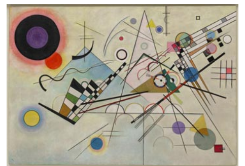
Work by Vasily Kandinsky

Home to the Carolina Art Association, established in 1858, the Gibbes Museum of Art is recognized among the oldest arts organizations in the United States. Housing one of the foremost collections of American Art from the 18th century to the present, the museum's mission is to enhance lives through art by engaging people of every background and experience with art and artists of enduring