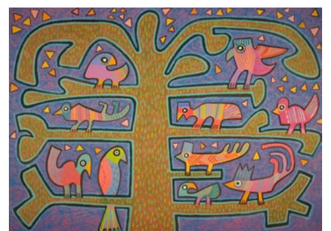
Linda Elksnin, "Tropical Birds", watercolor, gouache, Prisma pencil on archival paper, 2015

Comparing and contrasting historic making to contemporary making, cura-