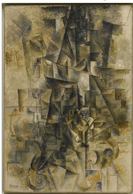
Work by Pablo Picasso

After purchasing a home along the Charleston Battery and a property in nearby Yemassee in the 1920s, Solomon and Irene Guggenheim quickly became prominent figures in the Charleston community. Before becoming the first director of the Guggenheim Museum, art advisor Hilla Rebay curated the 1936 and 1938 exhibitions, bringing international attention to Charleston and record attendance