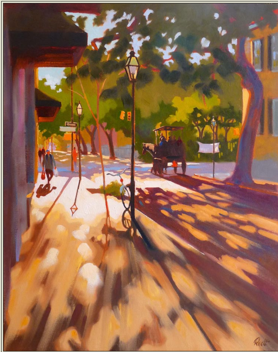
Dappled Light Oil on Linen ? x ? inches