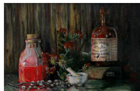
Work by Debra Keirce

For further information check our SC Commercial Gallery listings, call the gallery at 843/577-9295 or visit ( www. LowcountryArtists.com ).