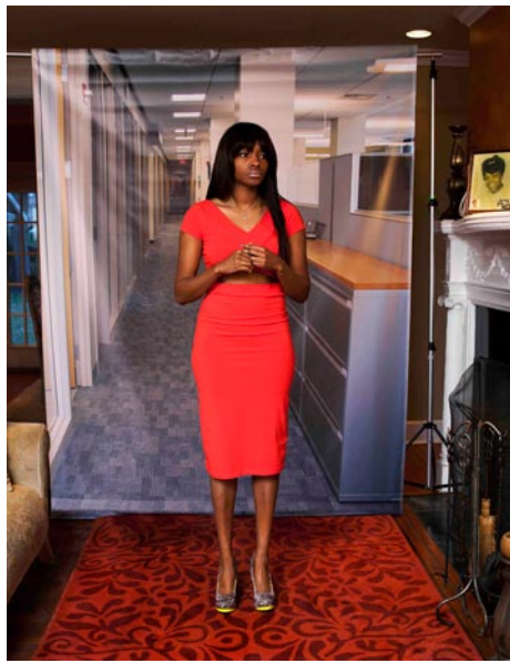
Work by Endia Beal

The Arts Council of Winston-Salem and Forsyth County, the first locally established arts council in the United States, enriches the lives of area residents every day. It raises funds and advocates for the arts, makes grants for arts in education, sponsors events with other arts organizations, strengthens cultural resources, develops social capital, and aids economic development. In its 2012 grant cycle, The Arts Council made Organizational Sup-