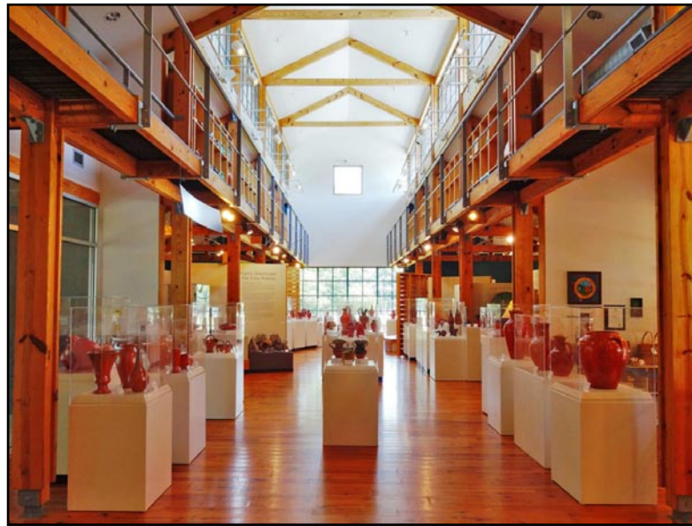
NORTH CAROLINA POTTERY CENTER

info@ncpotterycenter.org www.ncpotterycenter.org