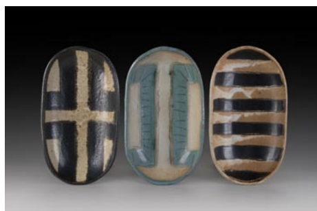
Works by Courtney Martin

The 5th Annual Spruce Pine Potters Market will take place at the Cross Street Building in downtown Spruce Pine, NC, on Oct. 8 & 9, 2011, both days from 10am-5pm. Admission is free and light breakfast and lunch options will be available on site, served by Little Switzerland Café.