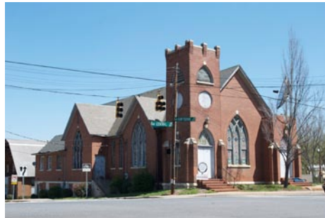
A view outside the church