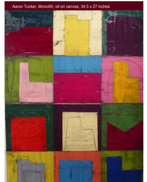
Aaron Tucker, Monolith , oil on canvas, 34.5 x 27 inches

ON VIEW Gallery Artists, Featuring Aaron Tucker September - October